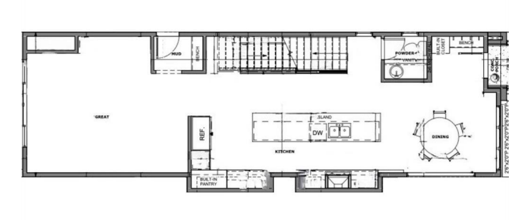
Main Floor Plan