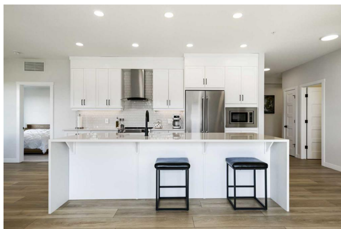
312, 55 WOLF HOLLOW CRESCENT SE REC-MEASUREMENT STANDARD - CALGARY AB MAIN LEVEL (AG) - 1134.96 Sq Ft. / 105.44 m² TOTAL ABOVE GRADE RMS SIZE - 1134.96 Sq Ft. / 105.44 m²

You know that feeling when you are on holidays? When you walk into your high end hotel room and take a big deep breath and then a huge sign of contentment resting your gaze on immaculately maintained and gorgeous surroundings? Then you take a step out to your over sized and spacious balcony to sit down and enjoy the golden hour and wonderful view, all the while thinking...I could live here. Well...here's your chance! Welcome to the Bow360 at Wolf Willow where you are invited to explore almost 1200sqft of luxury living. This stunning CORNER UNIT overlooking the greenspace and park will invite you in and have you feeling like you are in vacation mode immediately upon entering. The 9ft ceilings and spacious foyer opens up to a thoughtfully designed open floor plan that introduces you to TWO BEDROOMS plus DEN complimented with 2 FULL BATHS showcasing stunning black hardware with a professionally designed interior colour palette. Designed by award winning architects S2 you will enjoy the expansive living room with beautiful feature fireplace with floor to ceiling stone and luxury vinyl plank flooring through out the main living and designated dining area which is situated overlooking the deck and greenspace. Corner lot window treatments gives you additional over sized windows that are framed in by custom window treatments and the radiant heating keeps you nice and cozy during the cooler months while the central air vented through out the entire unit